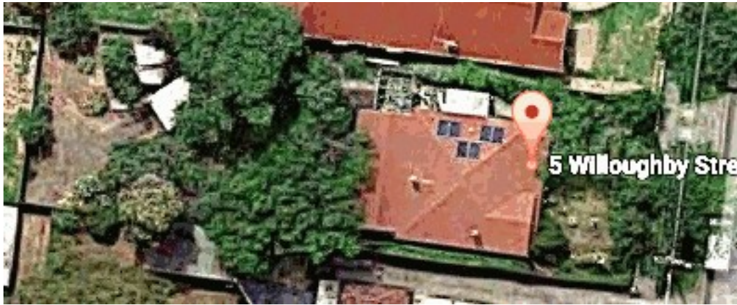
D/1065/2016 5 Willoughby Street RESERVOIR