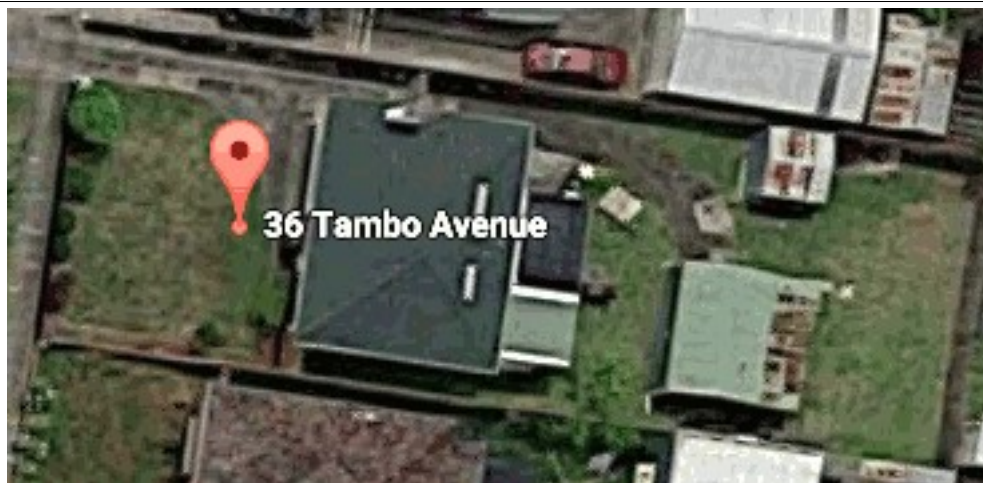
D/756/2016 36 Tambo Avenue RESERVOIR