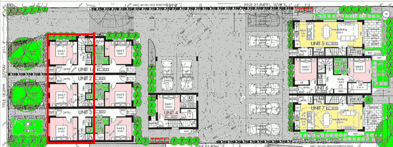
GND D/297/2016 4 McComas Street RESERVOIR