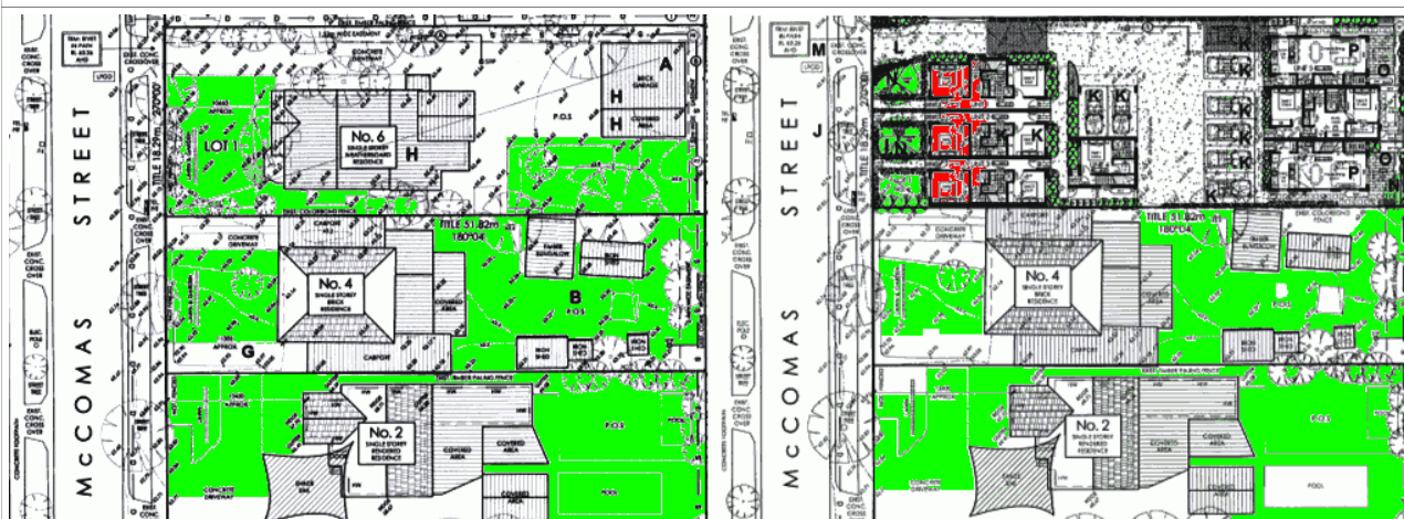
BEFORE FRONTAGE CREEP and AFTER as UNITS 1-3 CONSUME 1/2 OF FRONT GARDEN