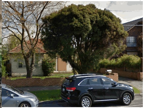
D/773/2016 286 Station Street FAIRFIELD