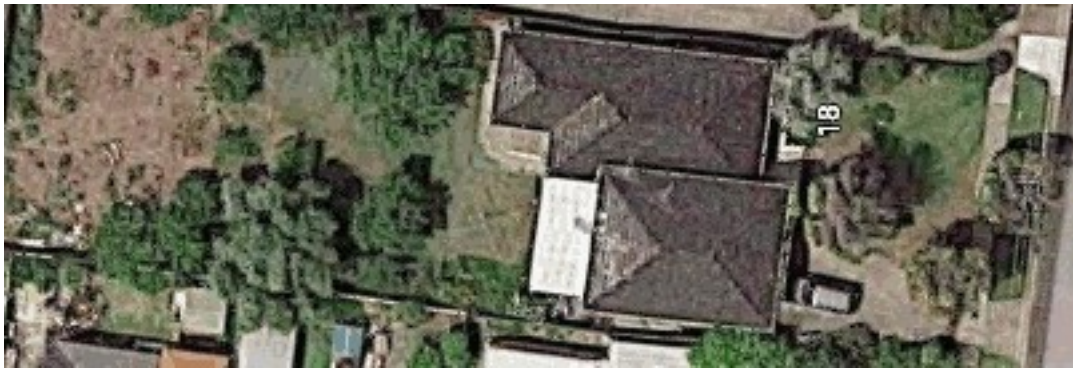
D/696/2016 18 View Street RESERVOIR