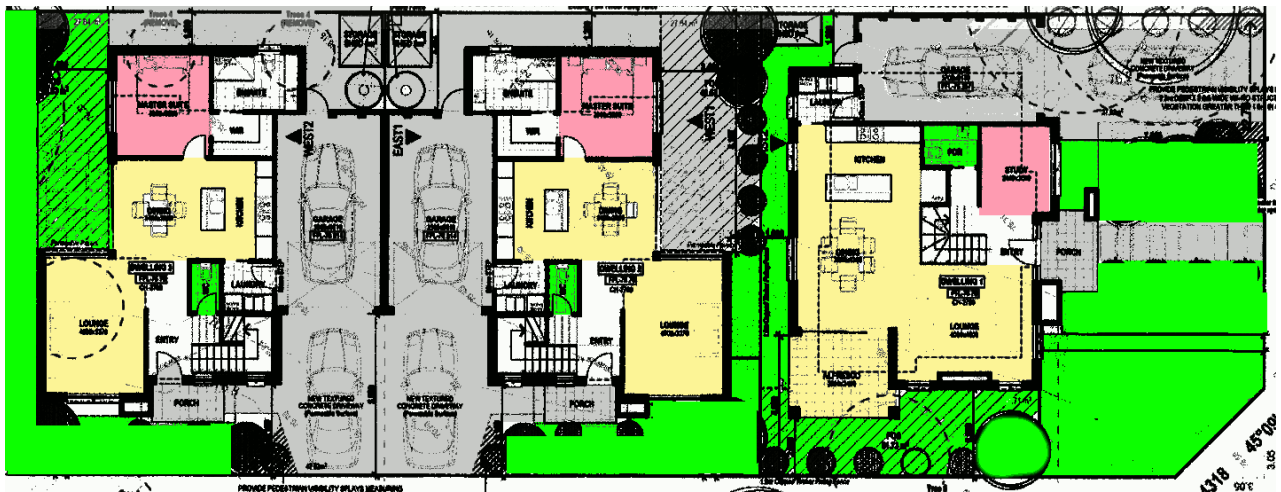
GND D/425/2016 16 Army Avenue RESERVOIR VIC 3073