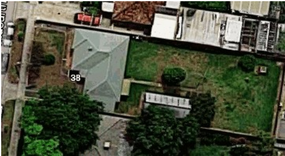
D/350/2016 38 MacArtney Street RESERVOIR VIC 3073