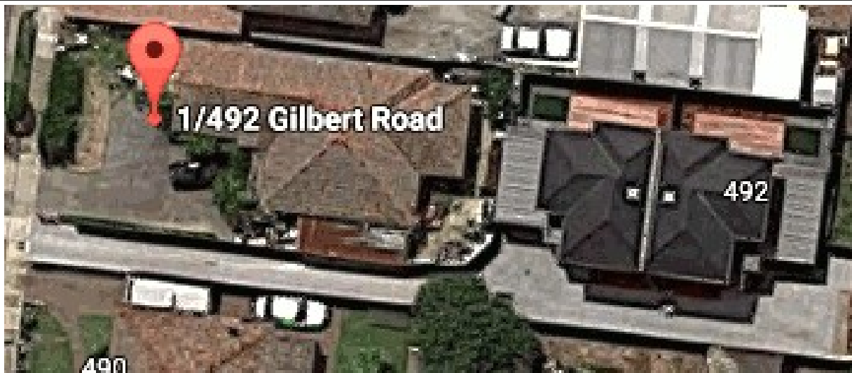
D/163/2016 1/492 Gilbert Road PRESTON VIC 3072