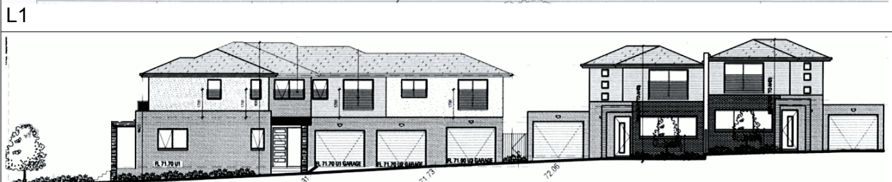
D/163/2016 1/492 Gilbert Road PRESTON VIC 3072