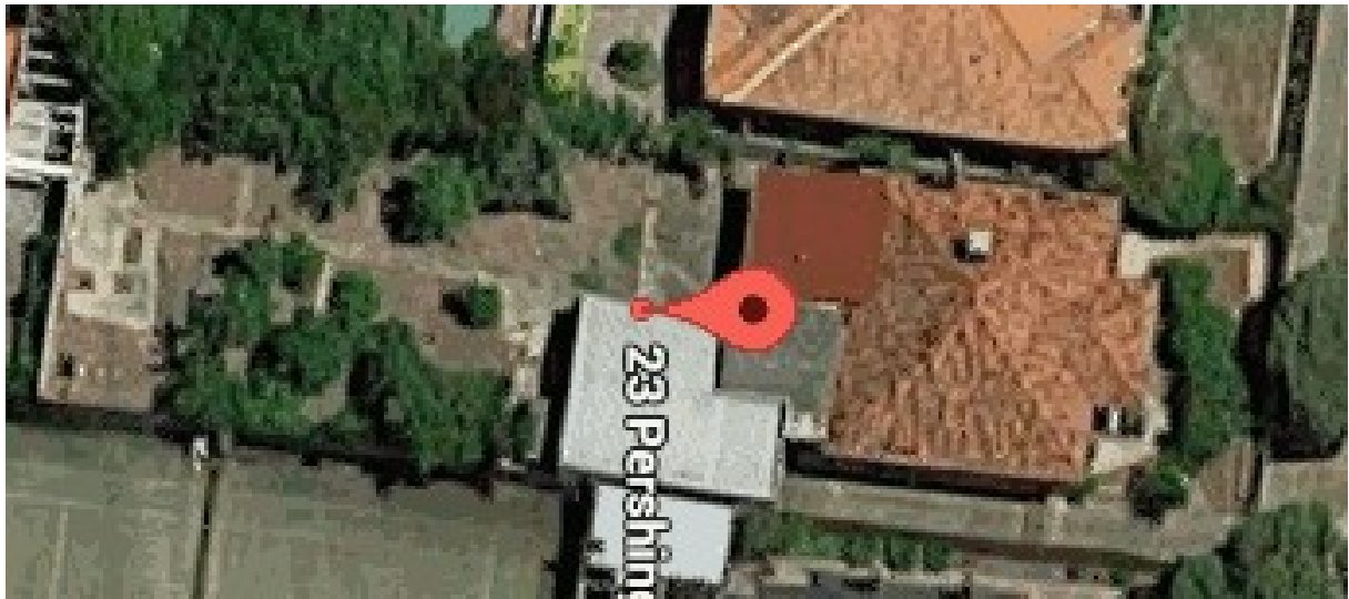
D/1089/2015 23 Pershing Street RESERVOIR VIC 3073