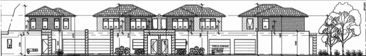
D/1089/2015 23 Pershing Street RESERVOIR VIC 3073