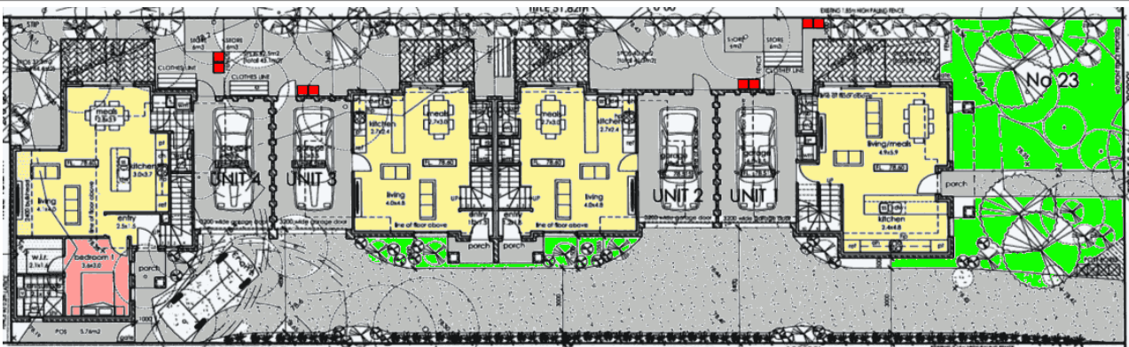
D/1089/2015 23 Pershing Street RESERVOIR VIC 3073