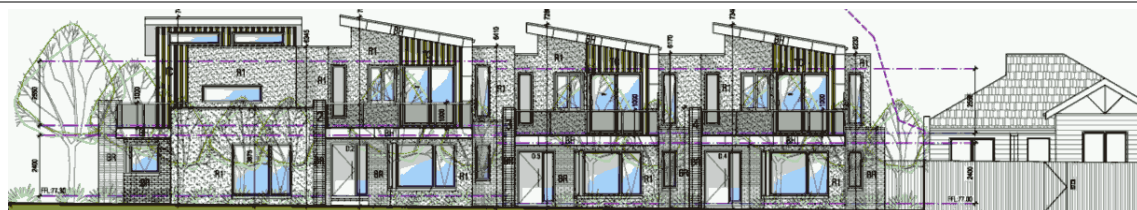
D/162/2016 39 Crawley Street RESERVOIR VIC 3073