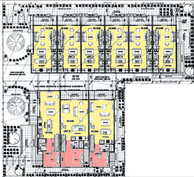
L1 D/49/2016 22-4 Olive Street RESERVOIR