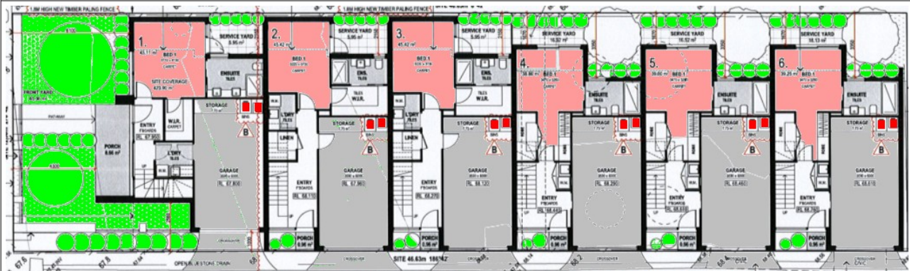
GND D/1071/2015 53A Pender Street THORNBURY VIC 3071 BINS IN GARAGES