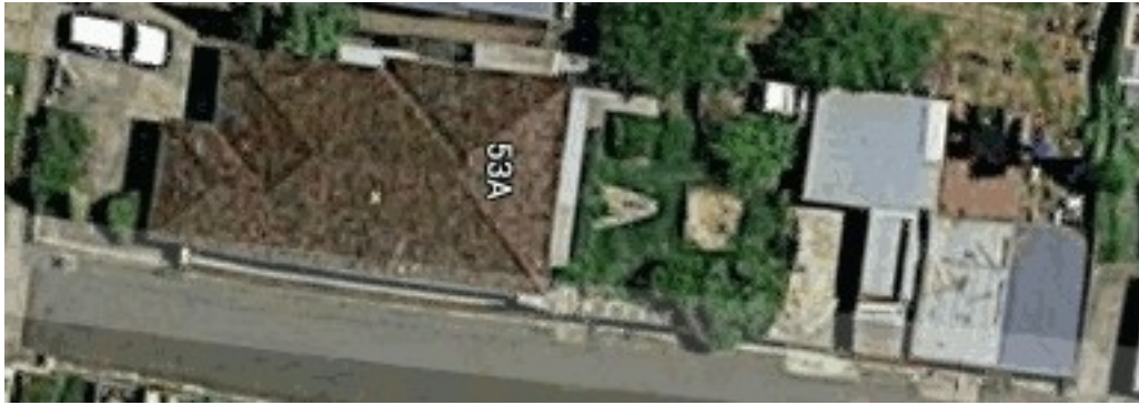
53A Pender Street