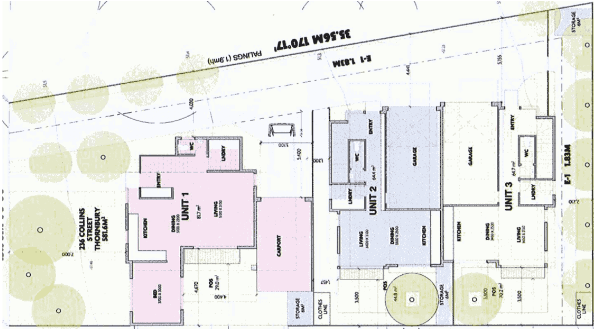
GND D/1036/2015 236 Collins Street THORNBURY VIC 3071