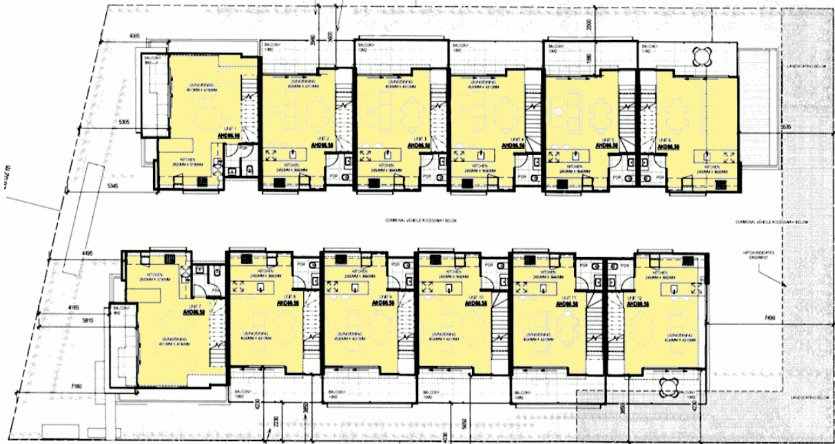
L1 D/229/2016 588 Plenty Road PRESTON VIC 3072